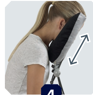
Adjust pillow height