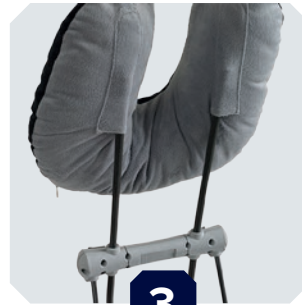
Insert rods into pillow sleeves