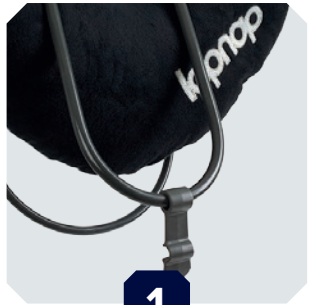
Unclip & remove pillow