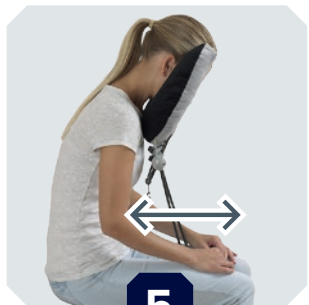
Set lap position